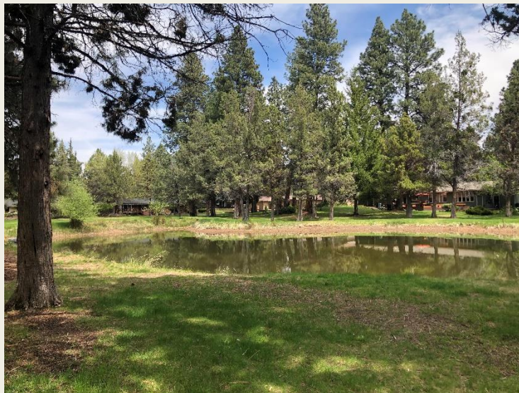
View of West Pond

Unfortunately, the COVID-19 restrictions forced changes in our plans. The May 2 nd Firefree Community Preparation Day & the second volunteer clean up day were replaced by other efforts. Small work groups cleaned and removed debris. In particular, I worked with 2-4 member Adult & Teen Challenge work crews to clean up the areas identified in our Fuels Reduction Grant plan, specifically removal of ornamental juniper bushes in the commons. Working with this local community group provided help to our HOA and offered great satisfaction to the men.