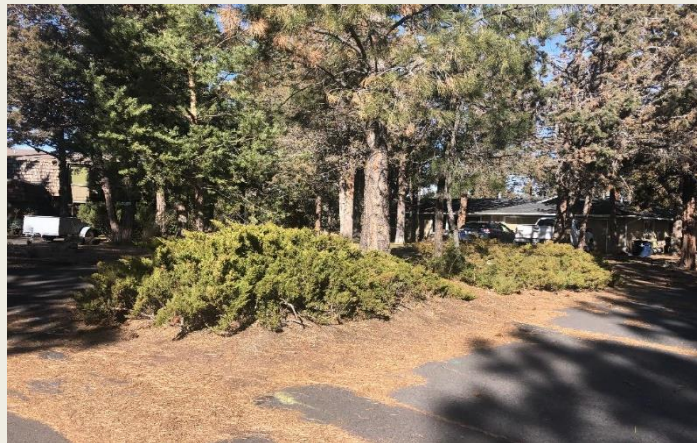
Juniper bushes BEFORE

Debris Removal: Tree Service-24 trees & 60 cubic yards, Landscaper- 216 cu yds, Work Teams Removal-168 cu yds, Community-3.5 cu yds/household=574 cu yds. Total debris removed = 1018 cubic yards + 20 trees.