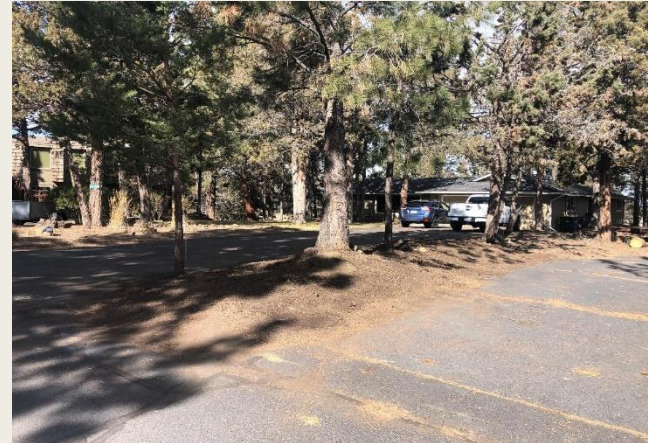
Juniper bushes AFTER